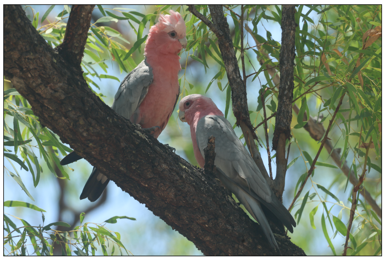
The lovely Galahs seen at Mt. Carbine Caravan Park.

Australia covers over 7 million kilometers squared and is the sixth largest country in the world. It encompasses a wide variety of ecosystems from deserts to alpine to rainforests, and it is home to some of the world's most unique wildlife, including monotremes and marsupials, and a host of bird species. Australia is divided into six states, each with its own attractions, ecosystems, and wildlife. During our 7-day tour, we spent our time in Queensland. In only a week, we saw over 200 bird species, a total of 17 mammals including 7 kangaroo species, 4 species of possum, and other wildlife including dingoes, bandicoots, and platypus. We also saw 8 species of reptiles and amphibians and some incredible invertebrates too! On our last day, we snorkeled the Great Barrier Reef and enjoyed the spectacular coral reefs and undersea life. Over the week, we also learned so much about the plants and animals of Australia, thanks to our very knowledgable guide.