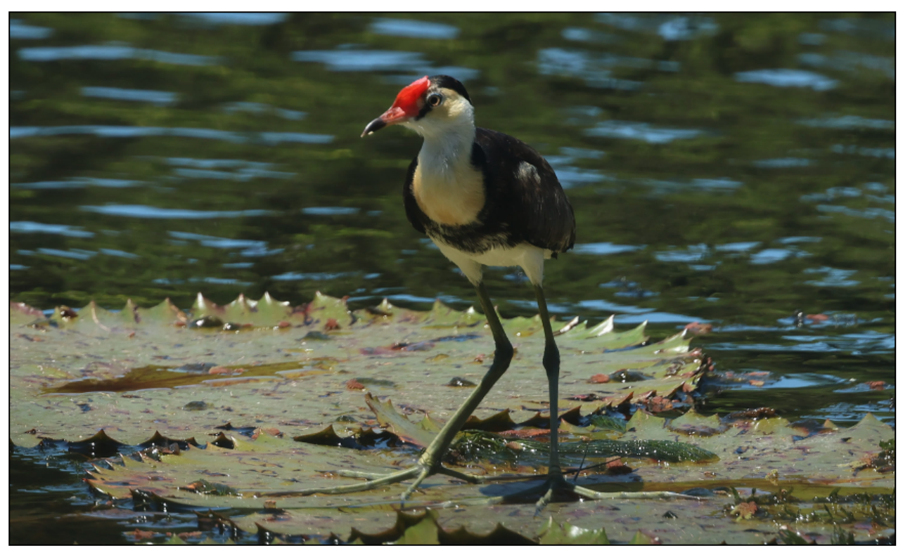
A Comb-crested Jacana showing off its very long toes.

After finishing up an amazing week in New Zealand, and some flight delays causing us to spend the night in Brisbane, we woke up early for our flight to Cairns. We met our guide, Jonathan, at the airport at 8 a.m. We had a quick breakfast and then headed to our first birding spot — the Cattana Wetlands. One of the first sounds we heard as we stepped out of the car was the lovely song of the Green Orioles calling in the trees. As we walked the trail to a hide overlooking the wetlands, we got some nice looks at a male Sahul Sunbird flitting about in a tree. Once at the hide, we observed several water birds including Royal Spoonbill , Magpie Goose , Pacific Black Duck , Black-fronted Dotterels , Common Greenshank , and Latham's Snipe .