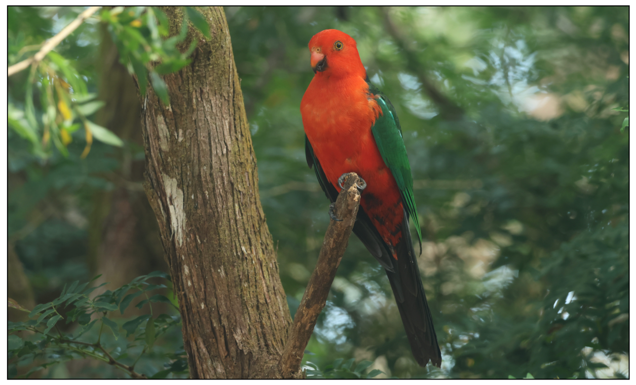
Australian King-Parrot perched above the feeders at the Rose Gums Wilderness Retreat.