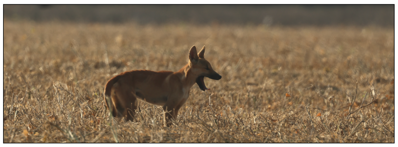
One of the Dingoes we spotted during the tour.

Today we took a boat trip to do some birding and to enjoy snorkeling at the Great Barrier Reef. We boarded the boat and were underway at around 8 a.m. Our first stop was Michaelmas Island, a roughly two hour ride from Cairns. The island was filled with nesting seabirds, including Brown Noddies , Brown Boobies , and Great Frigatebirds . Several other seabirds were flying around the island including Sooty , Bridled , Black-naped , Lesser Crested , and Great Crested terns . We also spotted Red-footed Boobies perched on a buoy. After a nice buffet lunch on the boat, our next stop was at a nice snorkeling site at the Great Barrier Reef. The water was a bit choppy, but we still were able to enjoy the beautiful colors of the coral, a plethora of colorful fish, a sea cucumber, and more. It was a fabulous end to a terrific trip. But, we still had one more stop to make. We returned to the Esplanade and picked up new birds for the trip including a lifer for the group - Terek Sandpiper ! We returned to our hotel for our final dinner and to get ready for our flights tomorrow.