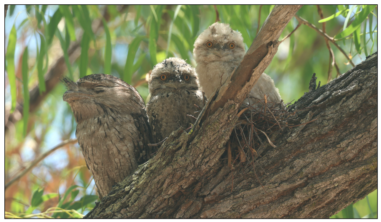
A trio of Tawny Frogmouths (parent and nestlings).

After departing Granite Gorge, we made a quick stop at Memorial Lake Mitchell. Here, we picked up more lifers for the trip — Radjah Shelduck and Fairy Martin , and saw a Whistling Kite feeding on something in the distance. We then made our way to Mt. Carbine Caravan Park. Despite the heat, we got some great views of some really spectacular birds. Just outside the park we saw a Great Bowerbird , showing off its purple nape feathers, as it carried a red plastic cap and laid it a the bower — a busy decorator. We also saw Apostlebird , Little Friarbird, Paleheaded Rosella, and Black-faced and White-bellied cuckooshrikes. As we walked around the park, we continued to add birds to our life list including about a dozen Galahs perching in the trees above, five Tawny Frogmouths, including an adult and two young, as well as Blue-headed Honeyeater. We also heard Blue-winged Kookaburras, but they flew out of sight before we were able to spot them.