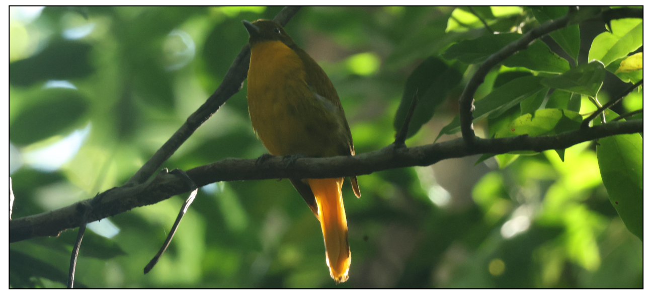
Male Golden Bowerbird.