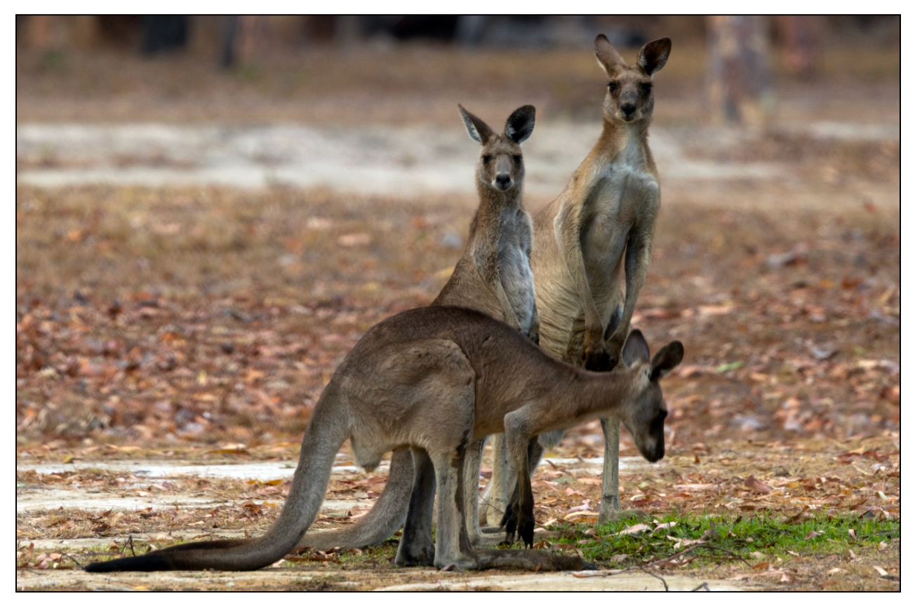
Three Eastern Gray Kangaroos seen on the second day of our trip.