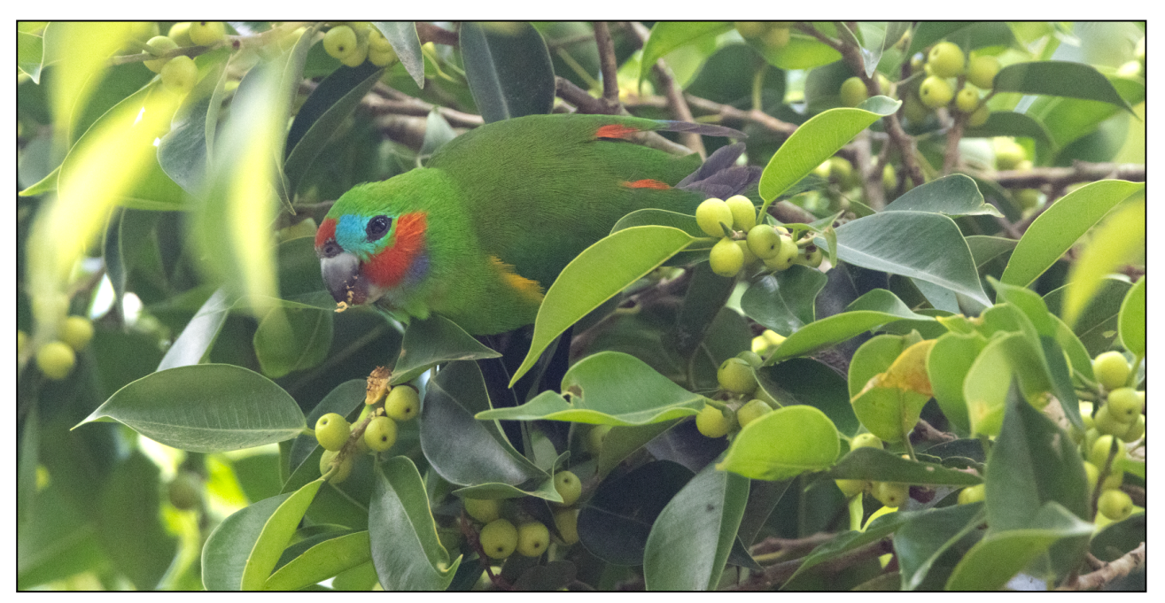
Our first sighting of a Double-eyed Fig Parrot.

male Southern Cassowary walking in front of someones house, peaking in the door. We watched it for a few minutes until it disappeared behind the house.