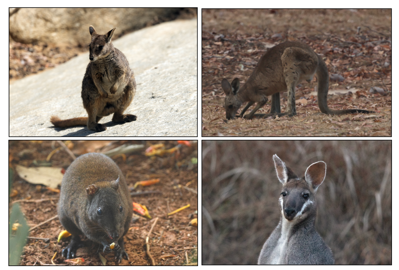
Four of the seven kangaroo species we observed during our trip, clockwise starting from the top left: Mareeba Rock Wallaby, Eastern Gray Kangaroo, Musky Rat-Kangaroo, and Whiptail Wallaby.

We got an early start this morning with a quick stop at the Daintree River and got some nice looks at Sahul Sunbird and Bar-shouldered Dove . We then drove out to Steven's Creek and our main target for today was the Buff-breasted Paradise-Kingfisher . Almost right away, we began to hear a few kingfishers calling along a dry riverbed alongside the road. As the morning progressed, the birds moved closer. Despite our searching, we couldn't quite get a look at the kingfishers as they were tucked away in the trees. We then walked to a forested trail nearby, hoping to see them cross in front of us. We caught a few glimpses, but never got a really clear sighting. Despite that, we had a great morning and saw some other really nice birds including Peregrine Falcon that flew in front