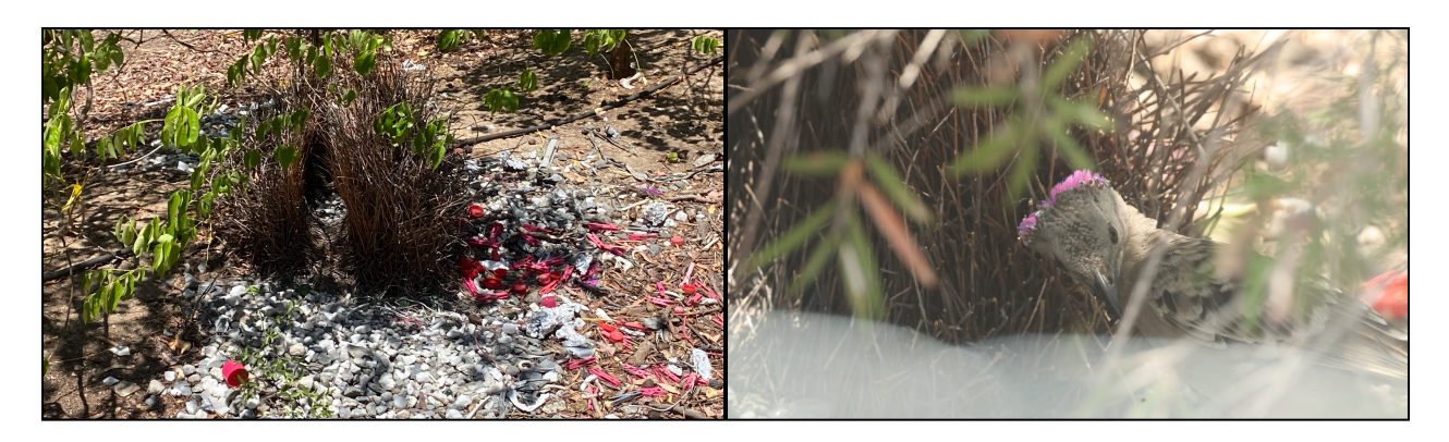
A Great Bowerbird's bower (left) and the bird, purplish nape feathers exposed, decorating its bower.

Gorge Natural Park to watch for Mareeba Rock Wallabies . We saw a handful of them resting in the shade among the beautiful boulders - the dominant species on the landscape.