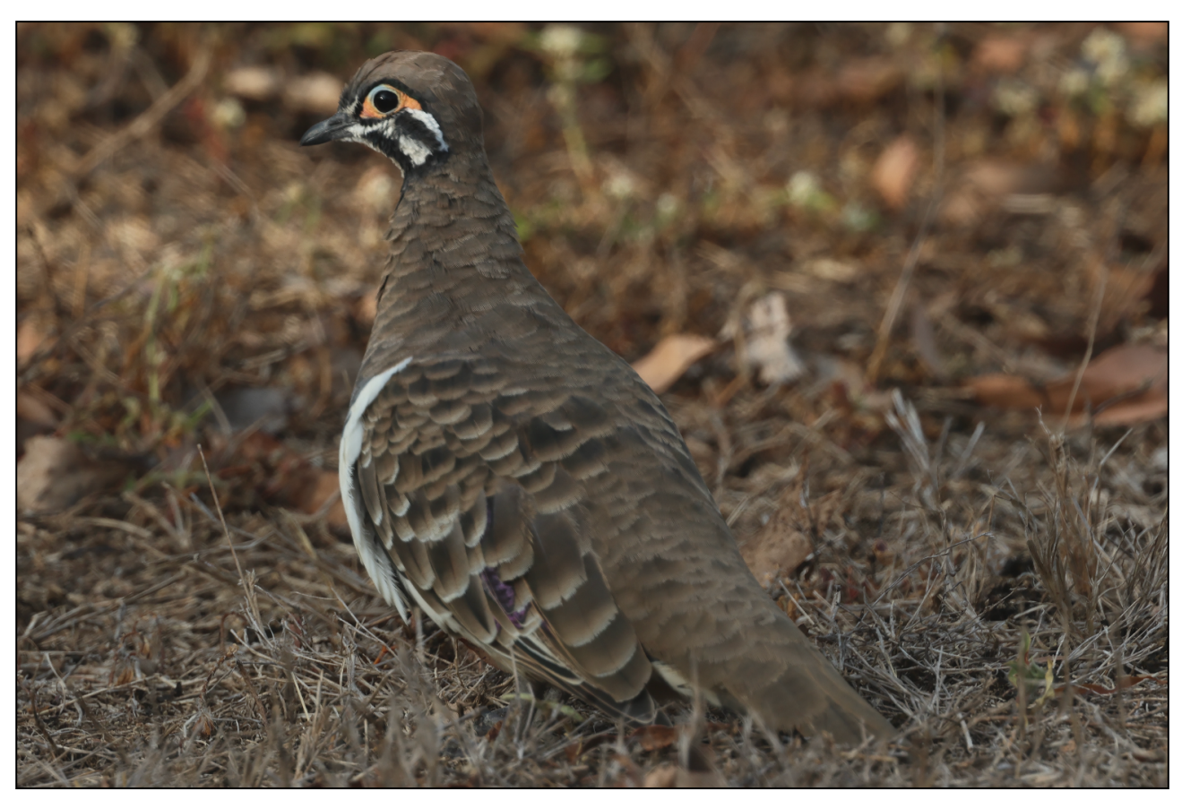
Squatter Pigeon.

We saw other mammals as well. Several Whiptail (Pretty-faced) Wallabies and Eastern Gray Kangaroos were standing just along the edge of the road, and in a field we spotted a young, lone Dingo ! As we scanned, we saw several more further off in the distance. It was an exciting sighting for the group.