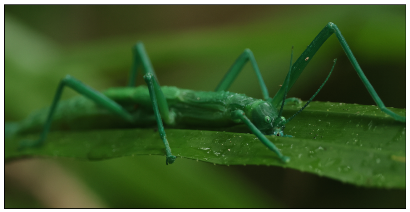
Peppermint Stick Insect in Daintree.

We then returned to our lodge for breakfast before heading down into Daintree. Here, we switched our focus from birds to the wonderful flora and invertebrates found in the Daintree. We enjoyed strolling along the Marrdja Botanical Walk and Dubuji Rainforest Boardwalk trail. Here we saw quite a few interesting animals. We saw two types of fish, Sooty Grunter and Snakehead Gudgeon , a Golden Orb-Weaver , as well as the fascinating Peppermint Stick Insect , which sprays a fluid said to smell like peppermint as a defense. Thus its name! We made our final stop for the day at Cowie Beach to search for Blue Soldier Crabs. Though we didn't see any crabs, we got a few new lifers for the trip: Pacific Reef-Heron , Red-necked Stint , Pacific and Siberian sand-plovers , and Gray-tailed Tattler , among others. We then returned to our beautiful lodge for the evening.