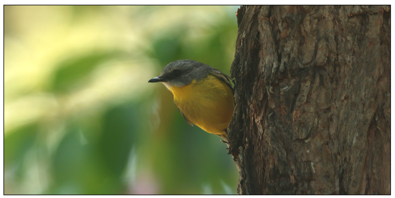
Eastern Yellow Robin seen at Emerald Creek Falls.

We then continued on to our next destination, with a detour to do some birding along some dirt roads lined with forest on each side and some streams. This was a very productive drive! Seemingly, bird after bird was popping up. In total, we saw 22 species along this route. Some highlights included White-browed Robin, Double-barred Finch, Varied Triller, Pale-headed Rosella, Sahul Cicadabird, and a Rufous Whistler feeding on a stick insect. We also got our first fleeting views of a Brown Goshawk soaring quickly past us high above. In addition, we saw our first mammal for the trip — an Agile Wallaby. We arrived at Emerald Creek Falls and did a short walk through the forest. Apart from the beautiful scenery, a Frill-necked Lizard clinging to the side of a tree along the trail and Eastern Yellow Robin also clinging to the side of a tree, were the highlights.